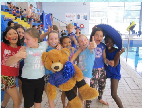
An enthusiastic cheer squad.