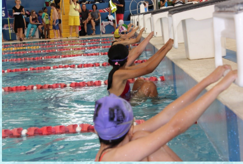
Competitors brace for backstroke race at the swimming carnival.