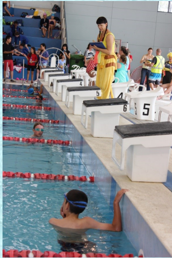
Swimmers await the judges, instructions at the end of their race .