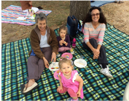
Families enjoyed a lovely evening at the at the preschool last Friday evening.